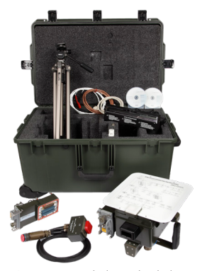
Accessories include a wheeled transit case (standard) and tripod (optional).

For complete certification list see APM-424(V)5 Specification Sheet