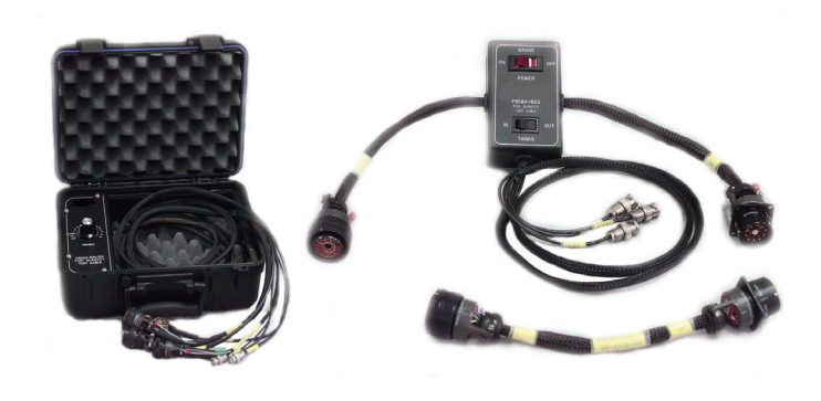
Large selection of aircraft specific interface cables available